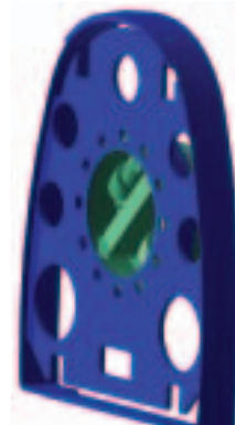
Flat Carrier Assembly. Motorized or Hand-Adjustable.