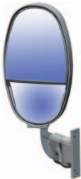
Aviastyle ® driver side, upright mirror with Spring-Break ® breakaway arm assembly.

Note: The above systems represent only a sampling of the many varieties available. Contact your Blue Bird dealer for help in specifying the Aviastyle ® mirror system that fits your needs.