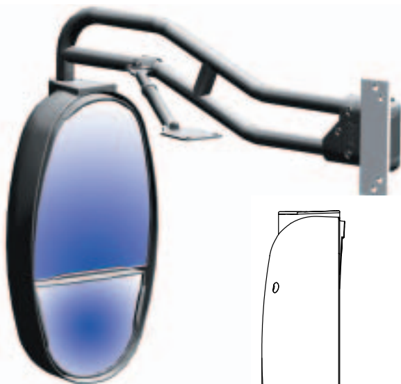
Aviastyle ® passenger side, overhang mirror with Spring-Break ® breakaway arm assembly.