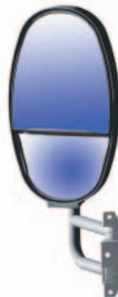
Aviastyle ® driver side, upright mirror with non-detent, breakaway arm assembly.