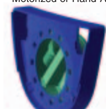
Convex Carrier Assembly. Motorized or Hand-Adjustable.