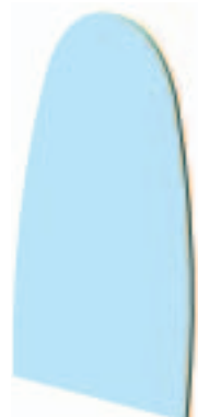
Flat Glass. Heated or Unheated.