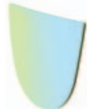
Convex Glass. Heated or Unheated.