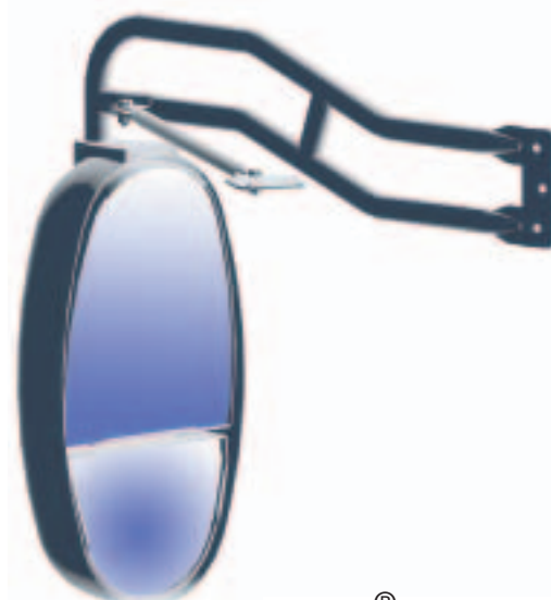
Aviastyle ® passenger side, overhang mirror with fixed, overhang assembly.