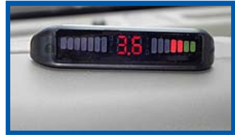
Dash mounted LED Panel

The HawkEye Plus Reverse Assistance System helps drivers avoid accidents, when the vehicle is in reverse, by automatically detecting objects behind the vehicle. An audible alarm along with a digital read-out alerts the driver that an object is in the vehicle's path and which side of the vehicle the object is on.