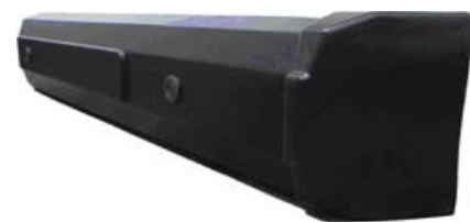
Romeo Rim Bumper with mounted sensors

The HawkEye Plus Reverse Assistance System helps drivers avoid accidents, when the vehicle is in reverse, by automatically detecting objects behind the vehicle. An audible alarm along with a digital read-out alerts the driver that an object is in the vehicle's path and which side of the vehicle the object is on.